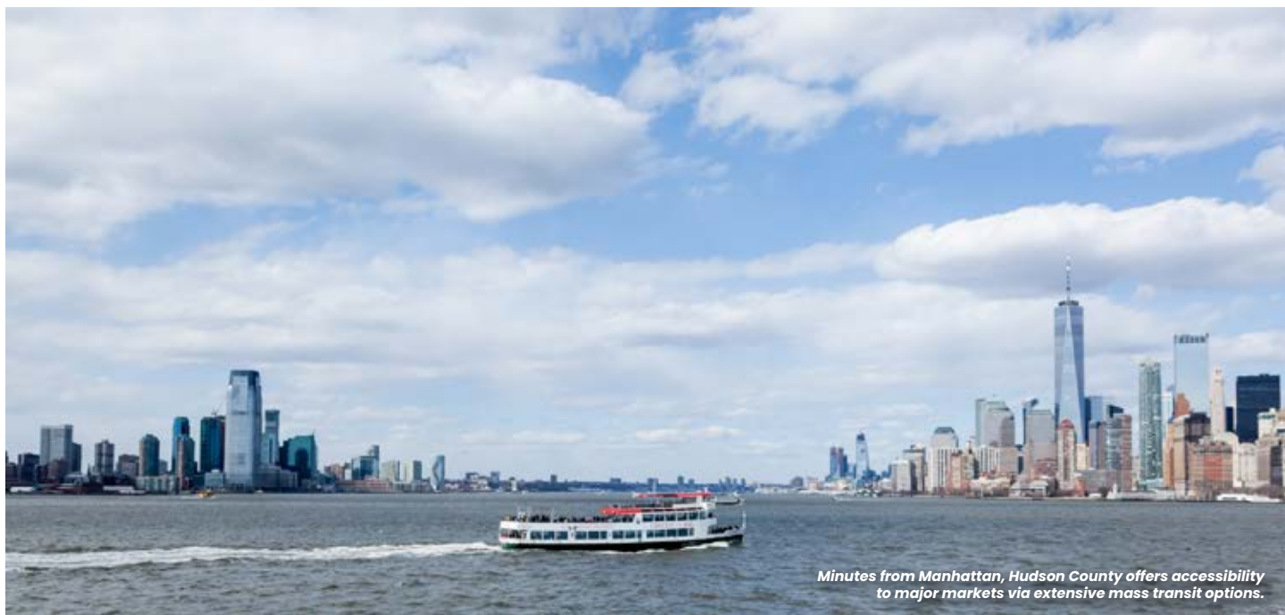
Minutes from Manhattan, Hudson County offers accessibility to major markets via extensive mass transit options.

The right place for you and your business