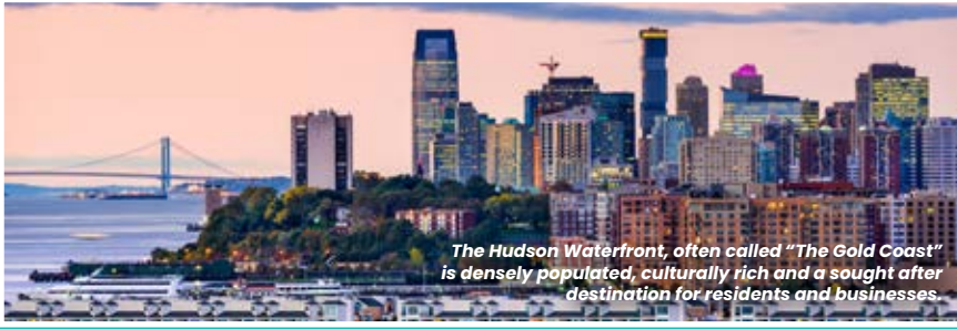
The Hudson Waterfront, often called "The Gold Coast" is densely populated, culturally rich and a sought after destination for residents and businesses.

New Jersey's resilience has been proven time and time again as we come together to support our communities and invest in a collective future. With unique assets and a talented, diverse population, Hudson County has become the fastest growing region in the state and continues to drive economic activity and growth.