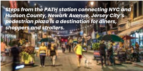
Steps from the PATH station connecting NYC and Hudson County, Newark Avenue, Jersey City's pedestrian plaza is a destination for diners, shoppers and strollers.

to become increasingly self-sufficient and resilient. The program's rules provide great flexibility to start your own business or invest in partnership with existing businesses and landowners.