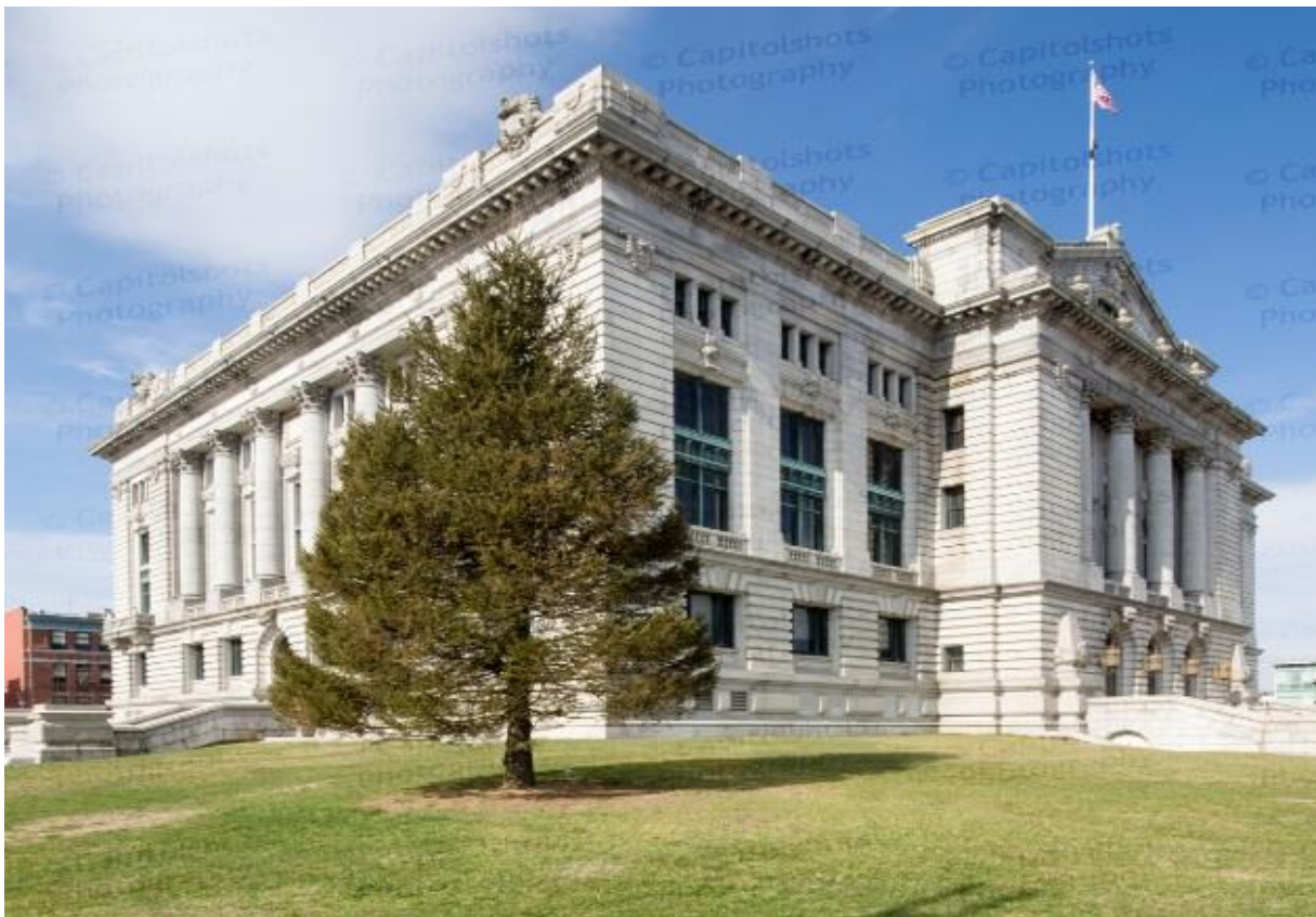
Brennan Court House