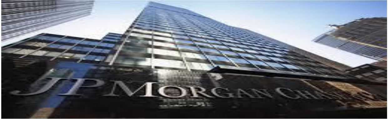
Jersey City, NJ